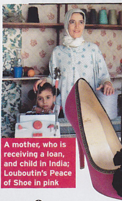
A mother, who is receiving a loan, and child in India; Louboutin's Peace of Shoe in pink