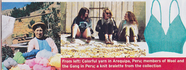
From left: Colorful yarn in Arequipa, Peru; members of Wool and the Gang in Peru; a knit bralette from the collection

The season's biggest trend? Designing like you give a damn—whether it's boosting local business or supporting trade and charity abroad